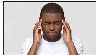
Sudden, severe pain

You should call 911 if the injury is serious, life-threatening or likely to become life-threatening.